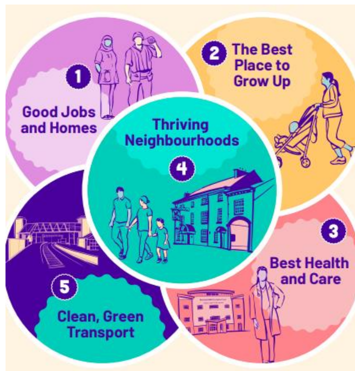
Figure 1 One Stockport, One Future – Delivering 5 Big Things