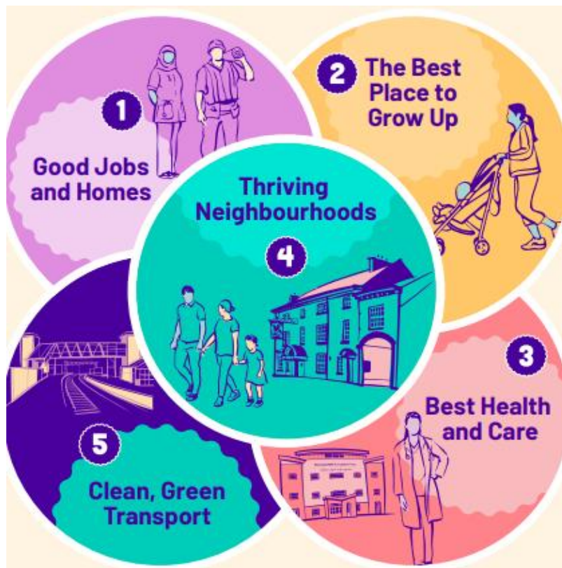
Figure.2: One Stockport, One Future – Delivering 5 Big Things

2.7 To deliver neighbourhood working we have agreed to work to seven neighbourhoods (see Figure 3) which are aligned with wards and area committees. Where possible/appropriate, services are already beginning to align to these footprints or have a named link. It is recognised that this will never be perfect, but partners are working towards a ‘best fit’.