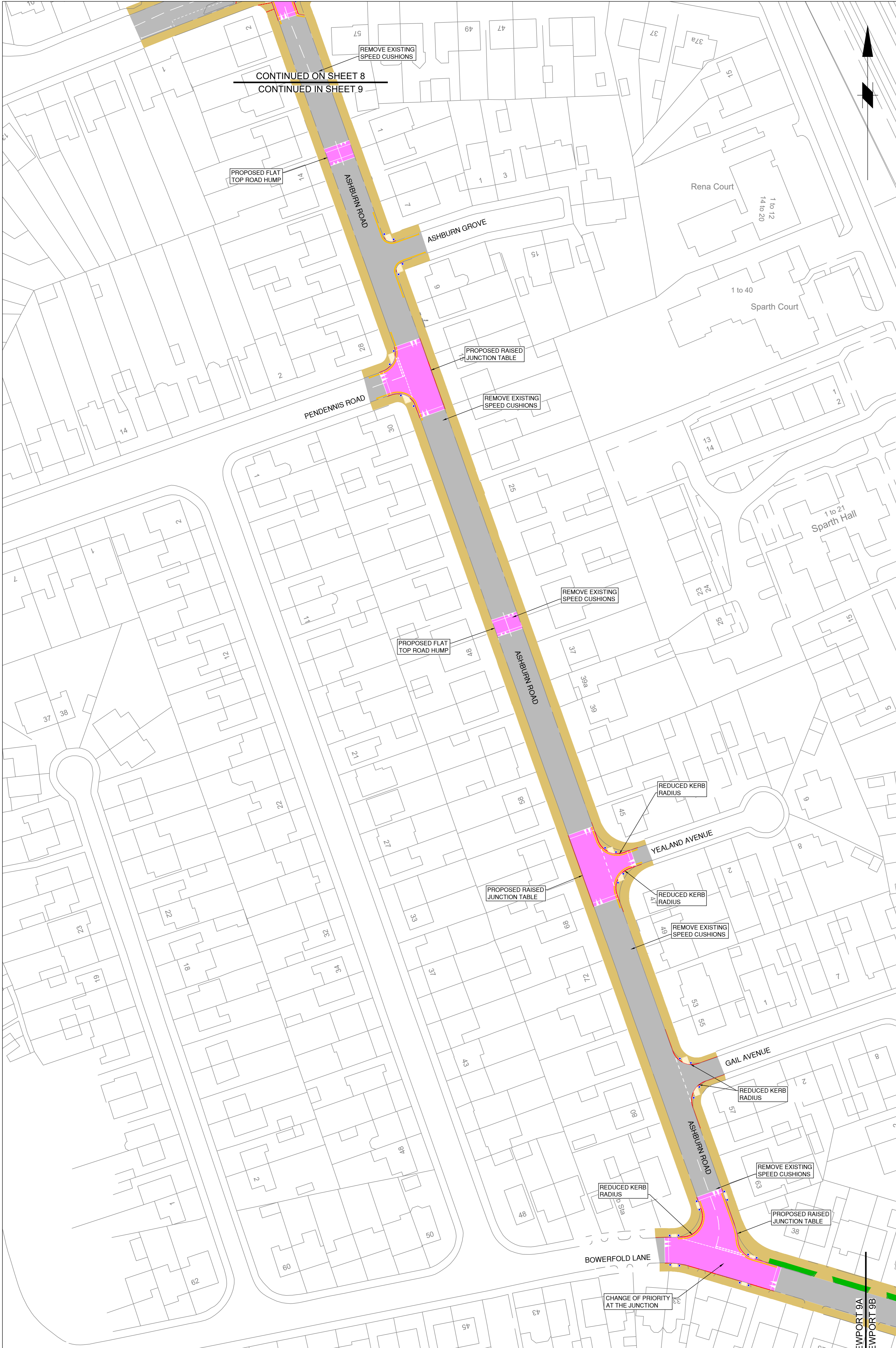
SHEET 9 (VIEWPORT 9A)