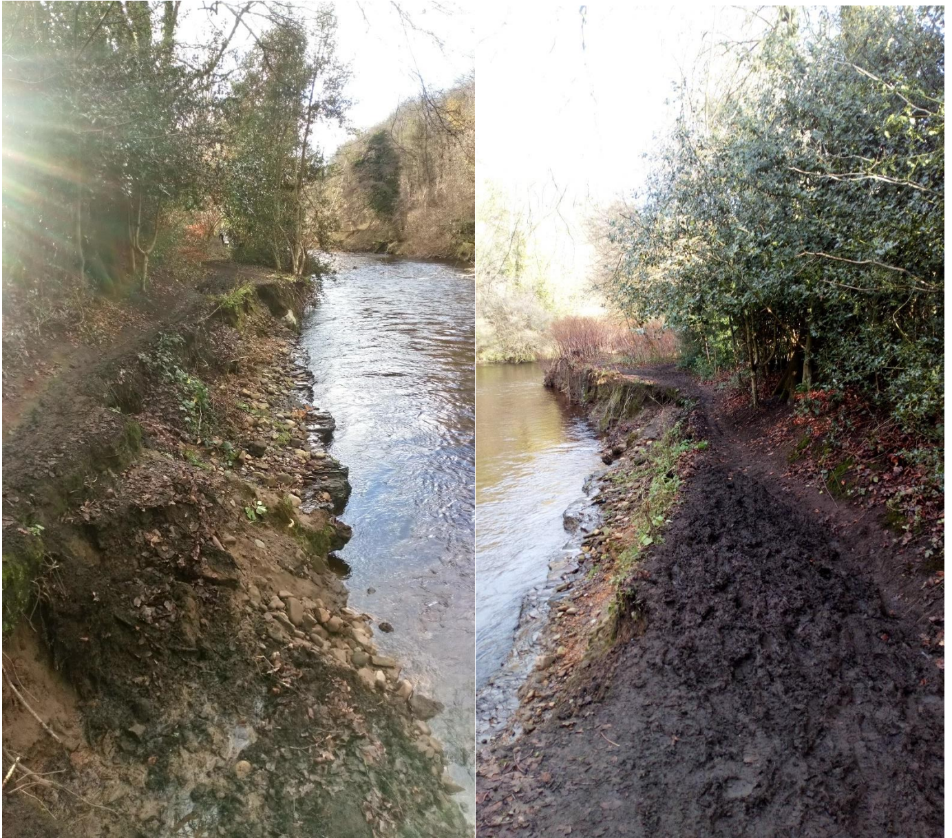
Affected area January 2021