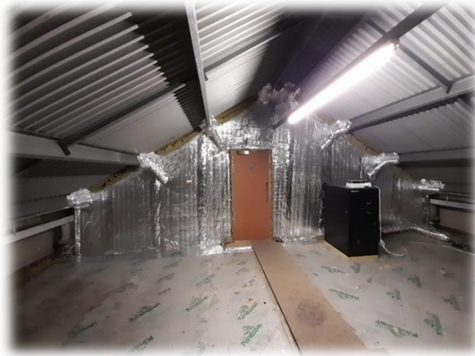
Pictures Above: New Fire barrier, compartmentation works at Lancashire Hill