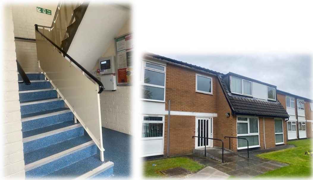
Pictures Above: Handrail balustrading & new front entrance door at Smithy Green