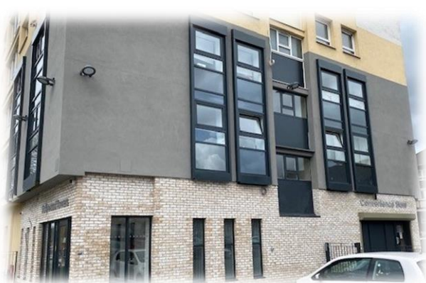
Pictures Above: Before and After photos of new façade works, including render and curtain walling