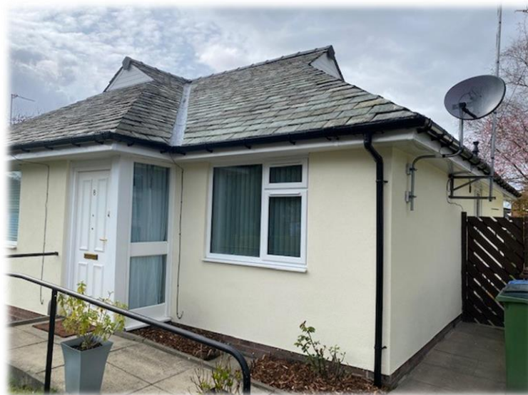
Pictures Above: Slate roof covering replacement at Woodfield Crescent, Romiley