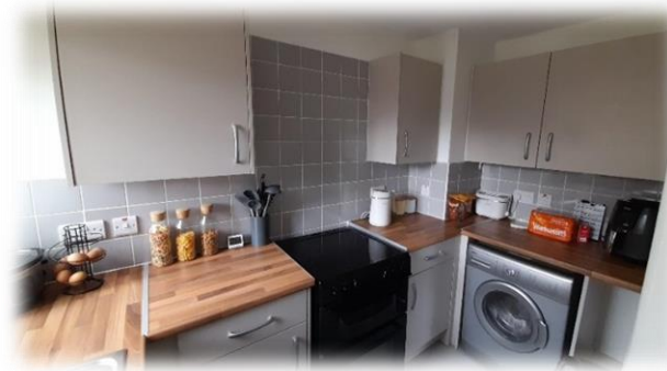
Pictures Above: Before and after examples of New Kitchens, fitted at customers' homes in 2022/23