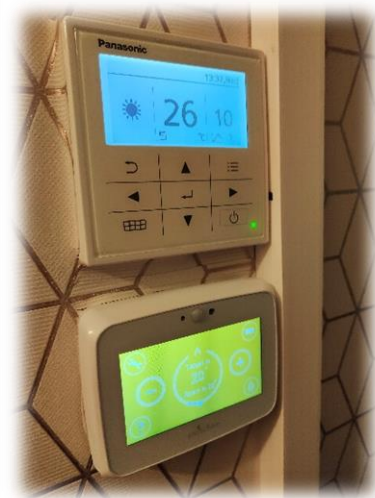
Pictures Above: (Right) Air Source Heat Pumps fitted at Garston Close (Left) New Heating Control Panel