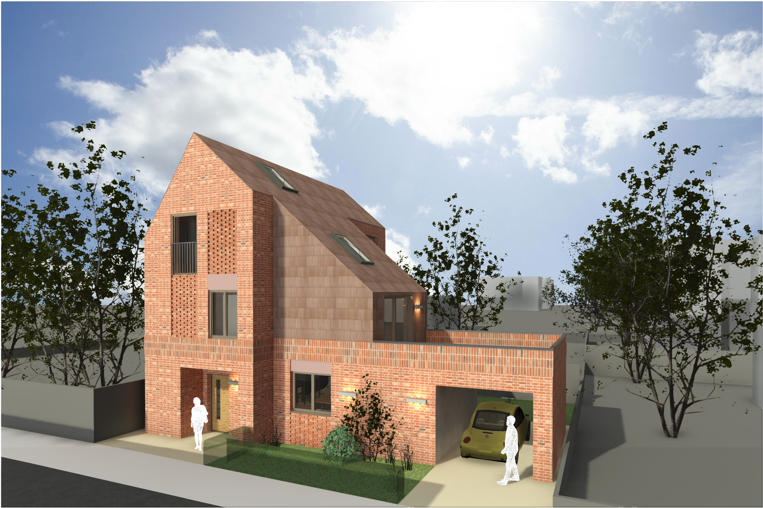
1 3D View 2