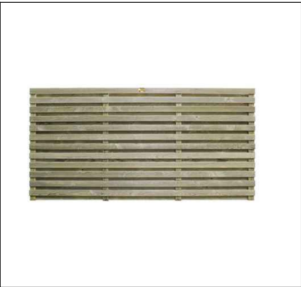
Venetian Hit & Miss Fence panel