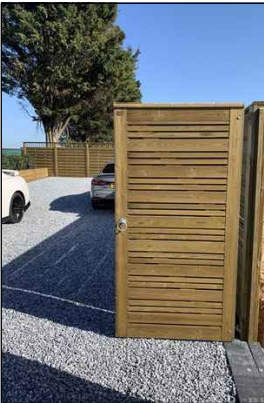
Urban Fence gate