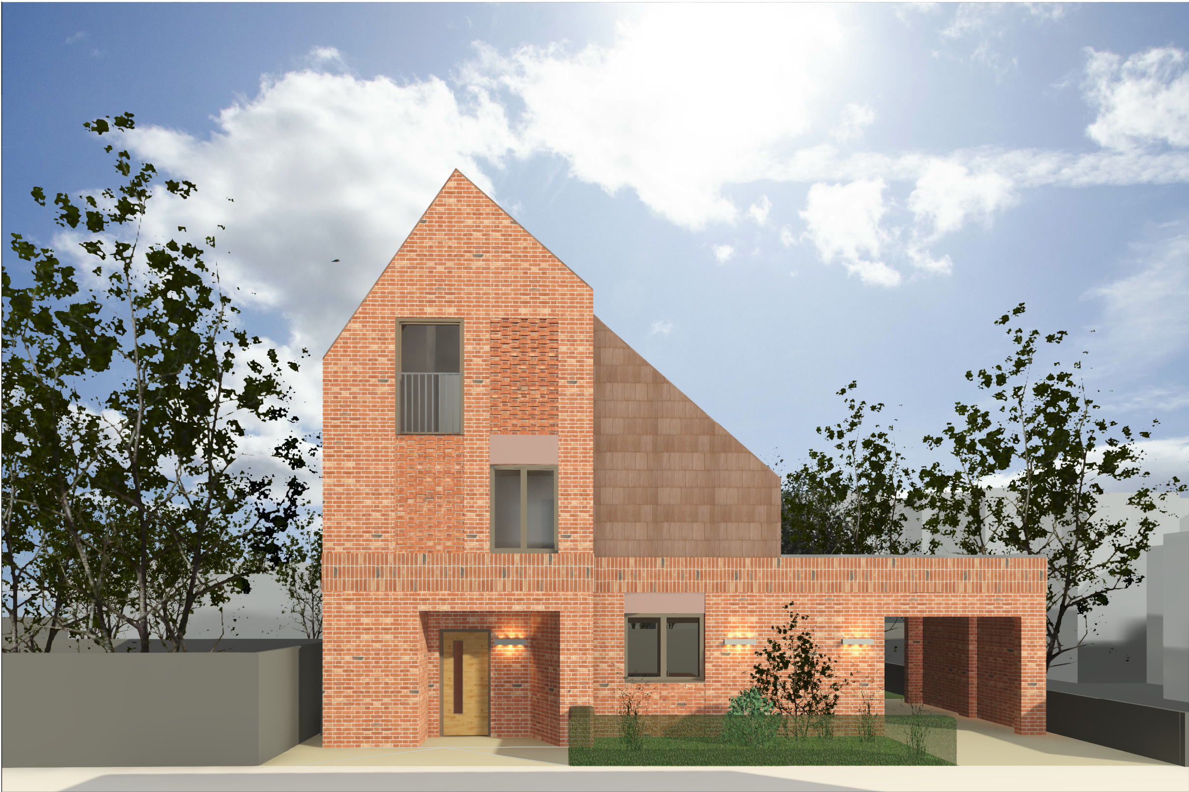
1 3D View 1