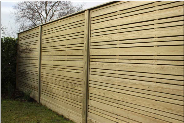
Urban Fence Panel