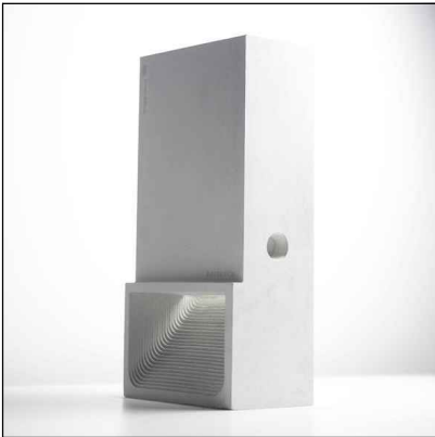
Integrated bat box