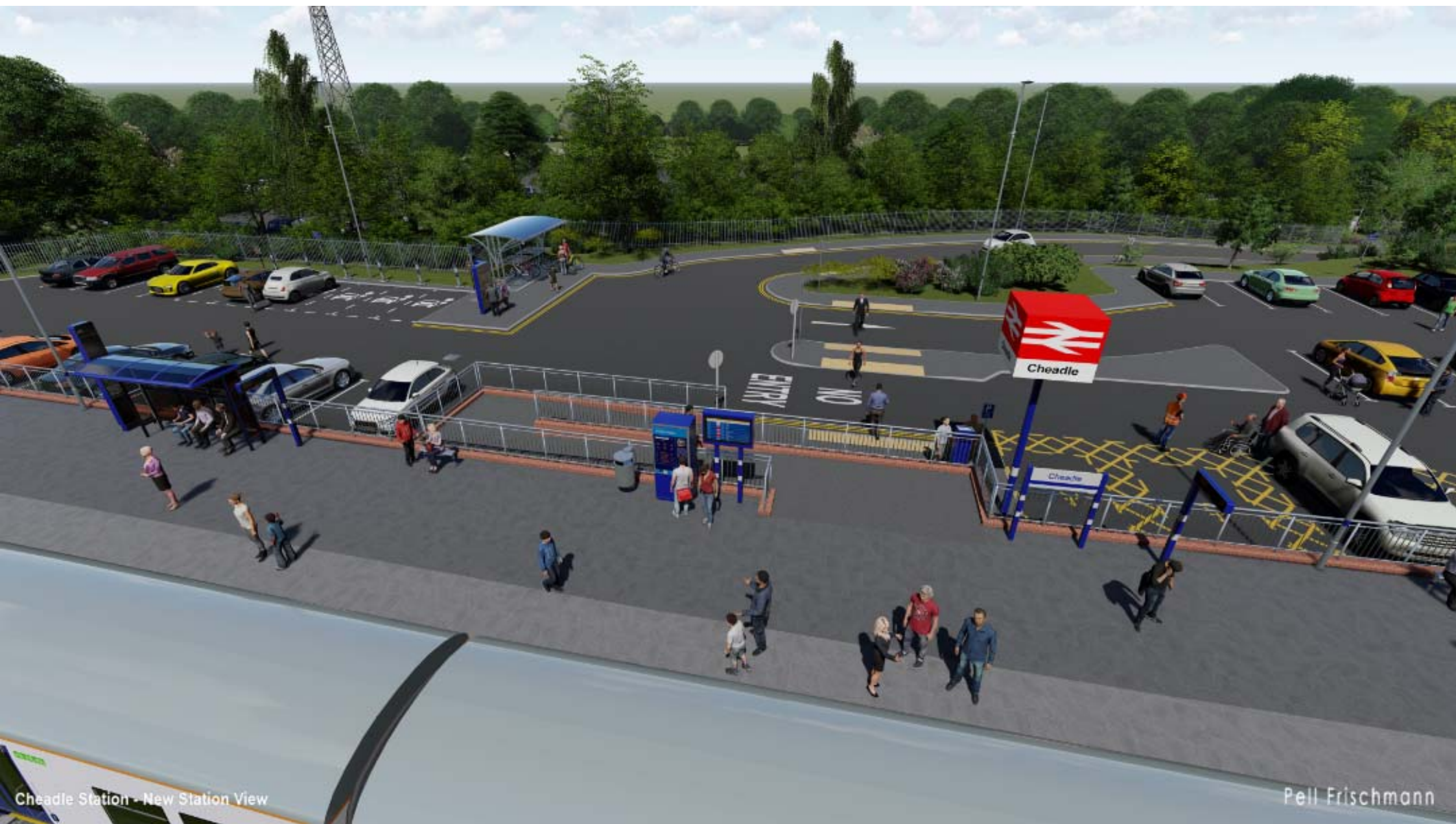
Cheadle Station - New Station View