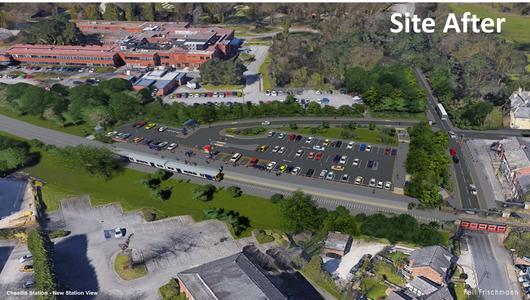
Cheadle Station - New Station View