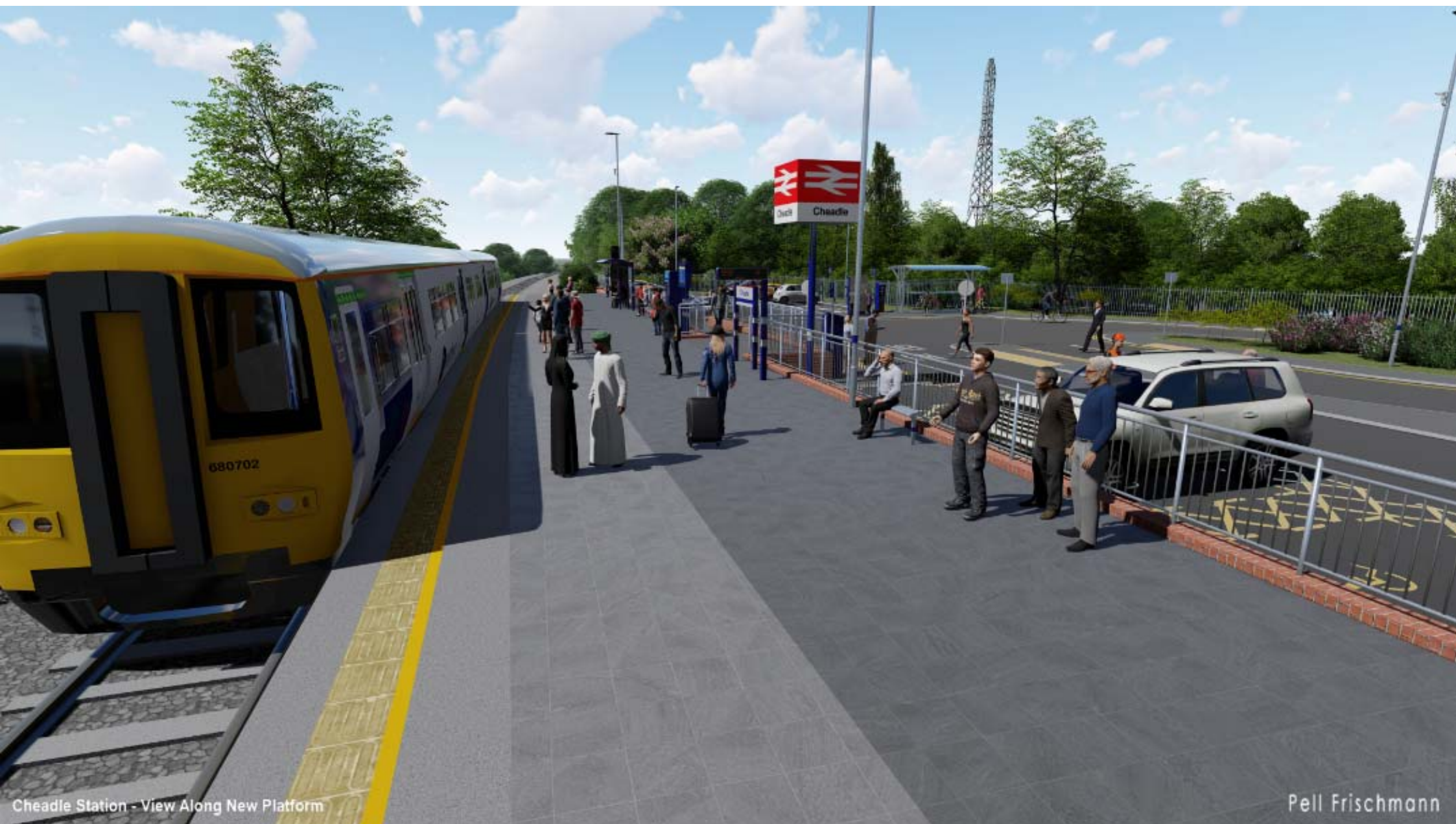
Cheadle Station - View Along New Platform