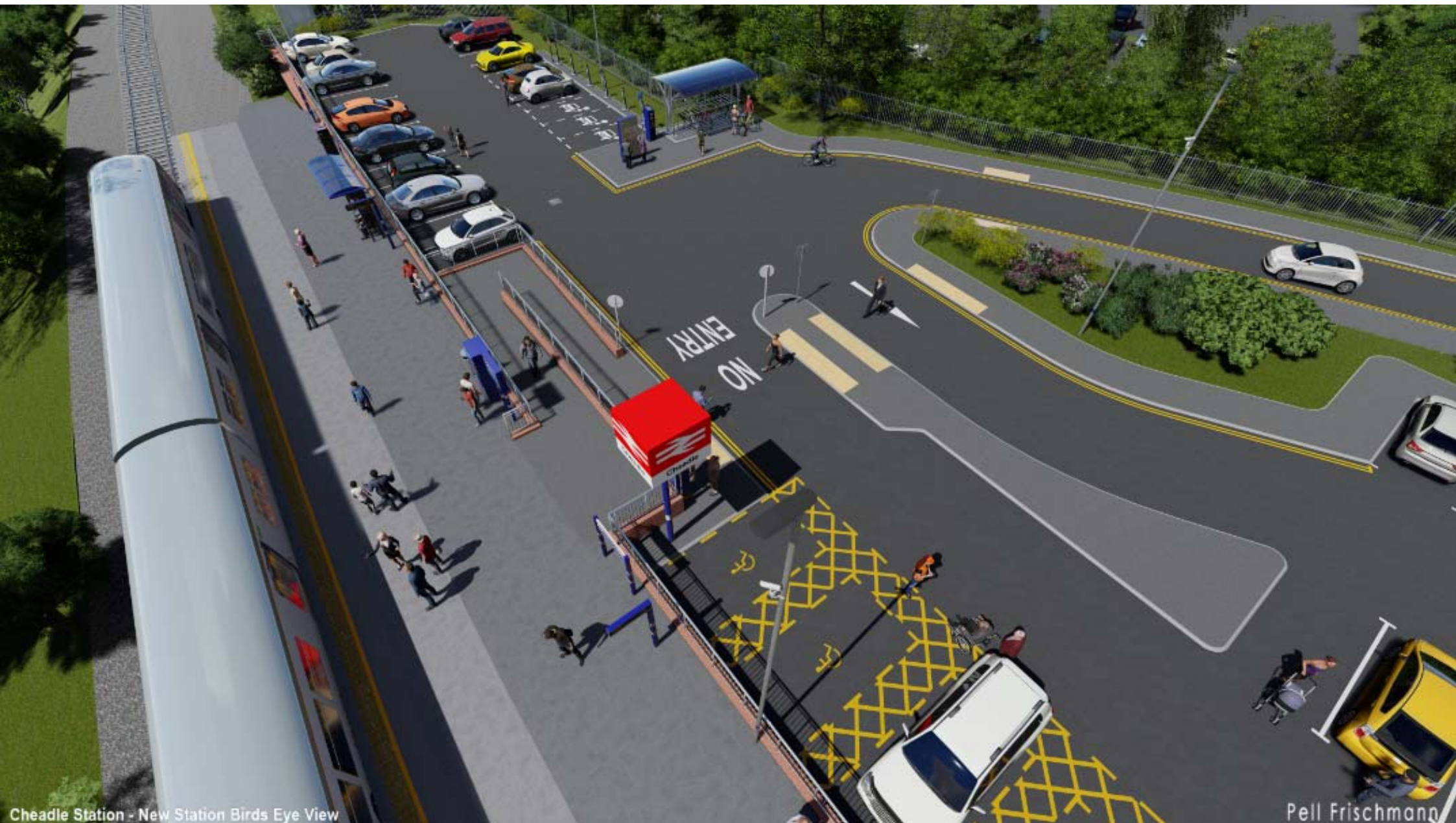
Cheadle Station - New Station Birds Eye View