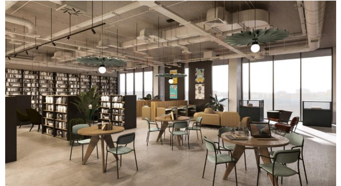
Indicative CGIs of what Stockroom could look like.