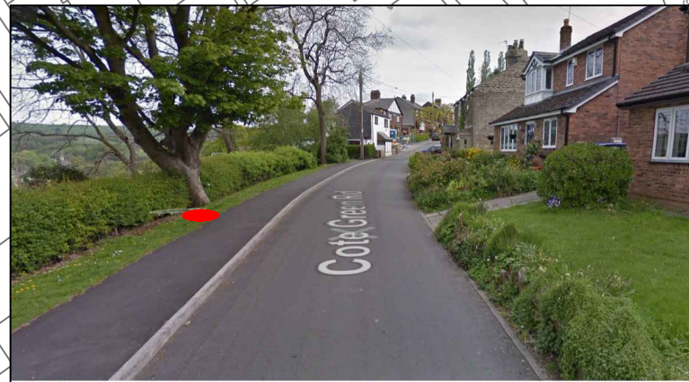
Location for sign ref TS2