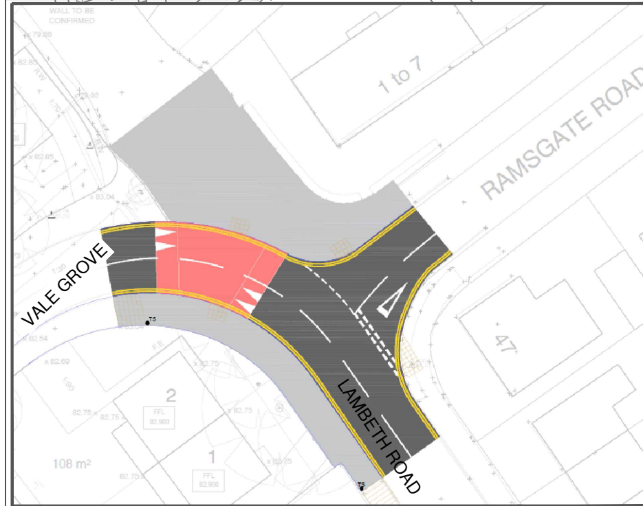
DETAIL 1- Proposed highway layout (including proposed double yellow lines) to be constructed as part of the new housing development

This map is reproduced from Ordnance Survey material with the permission of Ordnance Survey on behalf of the Controller of Her Majesty's Stationery Office © Crown copyright. Unauthorised reproduction infringes Crown copyright and may lead to prosecution or civil proceedings. Stockport Metropolitan Borough Council 100019571 2020