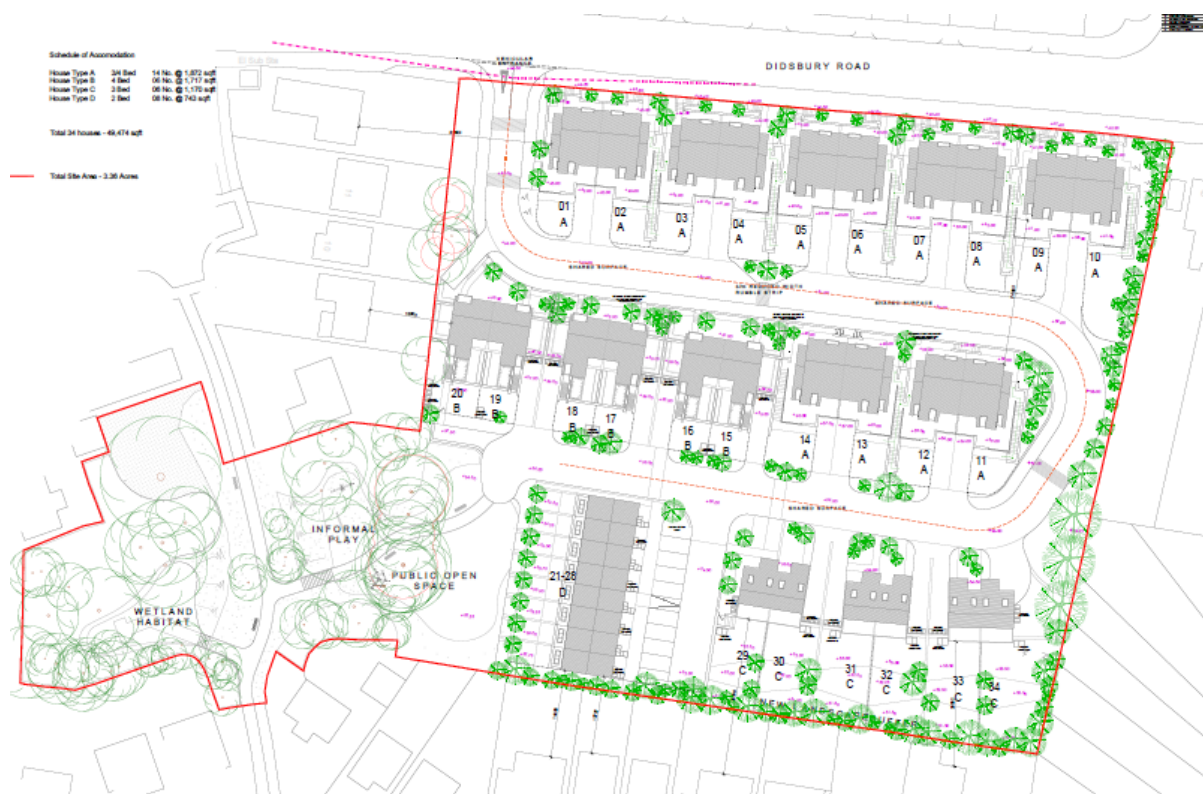
Proposed Site Layout Plan

The closest relationship of the development to existing residential properties is between Plot 10 and No. 179 Didsbury Road, Plot 20 and No. 9 Masefield Drive and Plot 21 and No. 15 and 17 Tennyson Close. These relationships can be seen on the site layout plan below: