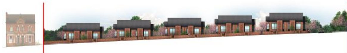
Proposed Street Scene, Didsbury Road

The existing tall boundary wall currently in place along this boundary will be reduced significantly in size to provide a more domestic scale, and new trees and landscaping will be planted to the front of the properties to further improve the visual appearance of the development on Didsbury Road. The scale of the development on Didsbury Road is considerably below the existing large semi-detached properties adjacent to the application site at 177 and 179 Didsbury Road.