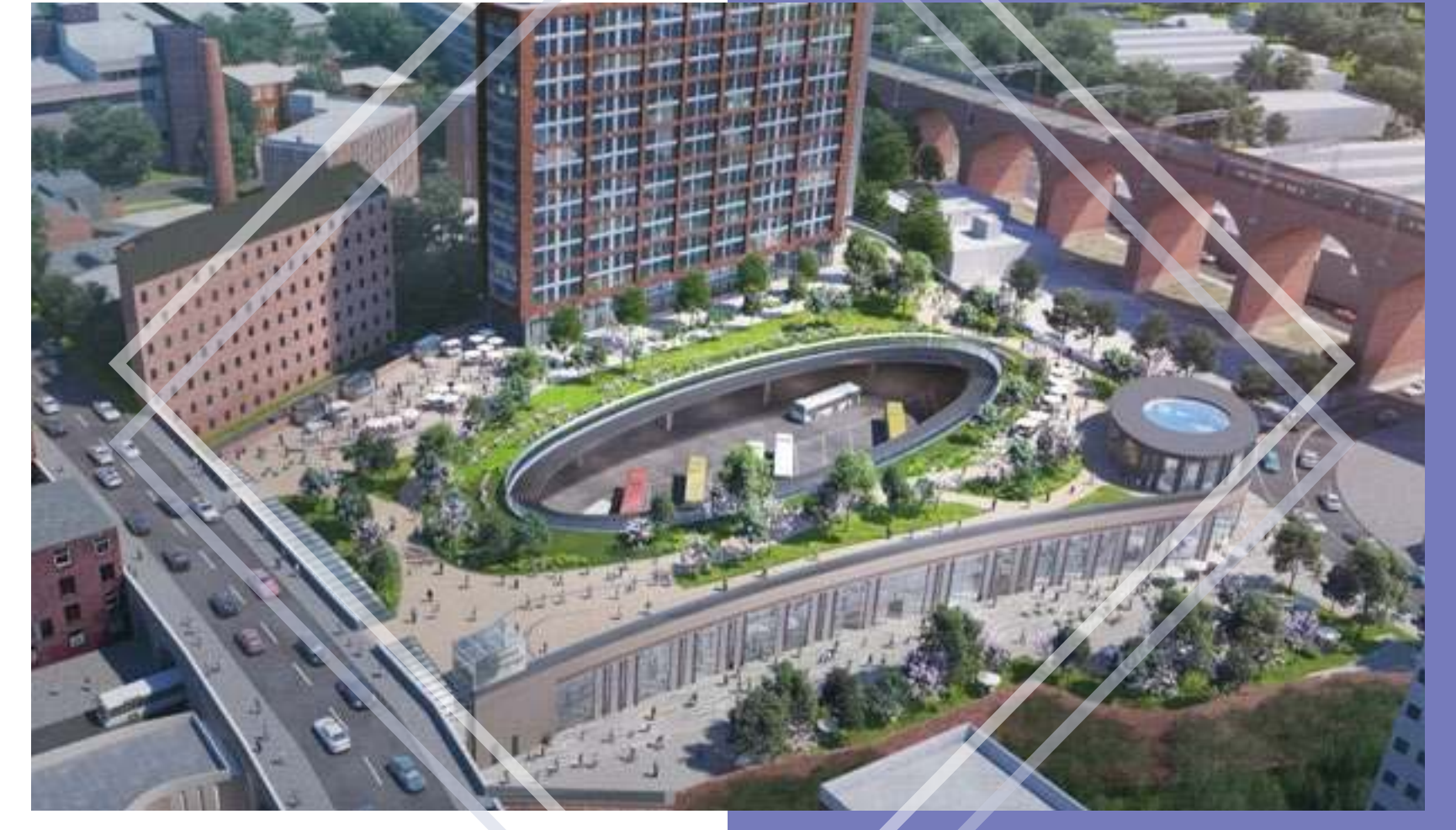
Stockport Mixed Use Interchange, £100m investment to be delivered by 2023

The Council have developed business cases to secure funding from the Greater Manchester Mayor's Challenge Fund to deliver several walking and cycling infrastructure projects across the district. These will include new crossings which will improve the link between central Stockport and Offerton, and measures which will improve the connections into Edgeley which lies beyond the Town Centre West area.