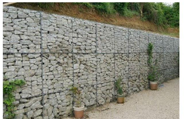
Indicative example of gabion wall to patio surrounds