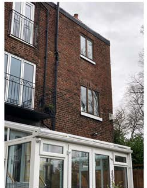
Examples of existing bifolds/french doors and wide windows, all in different materials and colour at the rear of the properties.