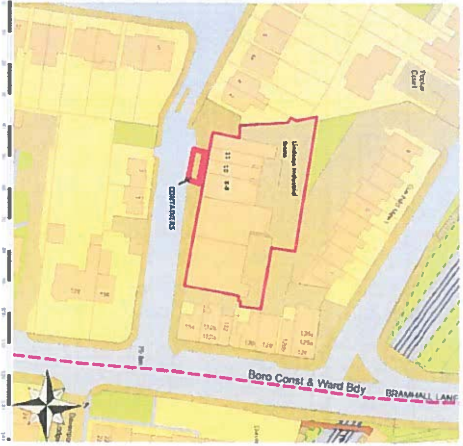
Scale: 1:1250 | Area: 2Ha | Grid Reference: 389865 386220 | Paper Size: A4